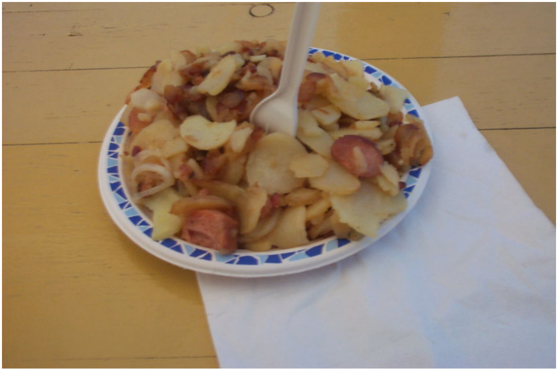
Bratkartoffeln – just what you need when 32C in the shade

As before, the hall with all the national societies, major dealers/manufacturers, and clubs was very interesting. We saw a stand with a demo of PLT, where a jpeg file was sent between two laptops over a PLT network. Horrible QRM was generated by this technology, which was very strong on a portable receiver, tuned to 40 metres a few feet away. It's fortunate this garbage doesn't seem to be catching on in the UK, as it would surely sound the death-knell of HF Radio.