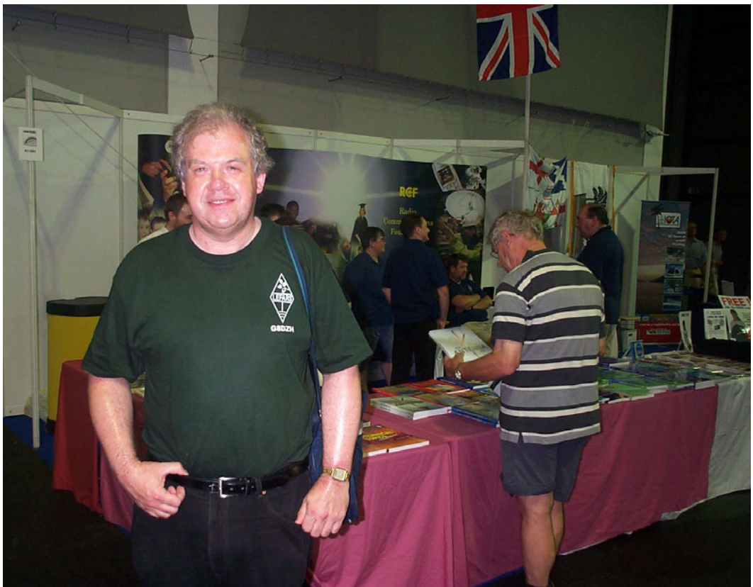
Notice the RSGB staff at the back of the stand...

We visited many of the stands of the national societies, which gave lots of free info, such as repeater lists, awards/contests rules, and touristy brochures. In contrast, the RSGB stand was very disappointing again, being basically, just a stall for selling books.